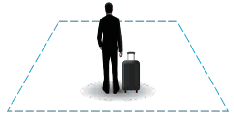
Space Only (US$460/m 2 ) 18m 2 at US$8,280*

* Frontage surcharge: 2-side open +5% | 3-side open +7.5% | 4-side open +10%