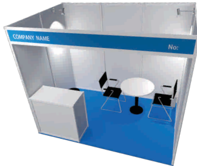
Shell Standard B (US$520/m 2 ) 9 m 2 at US$4,680*