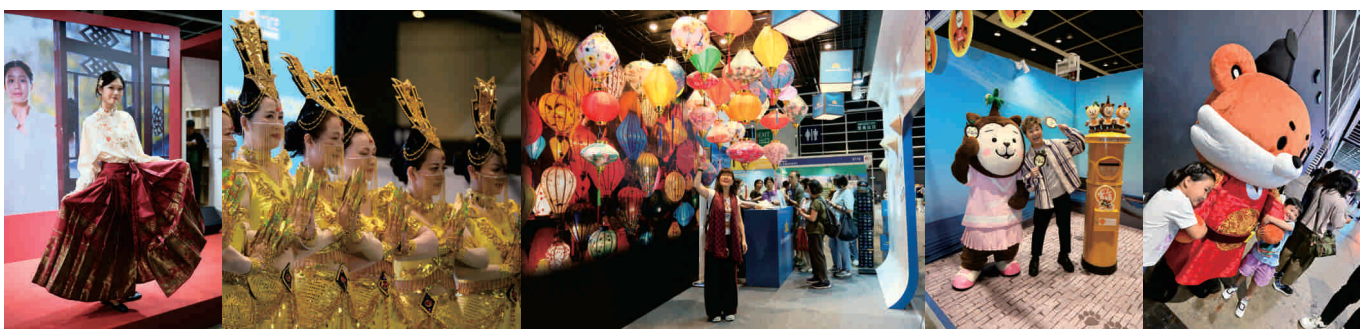
All photos are taken at ITE24

And offer great travel fun too as inside the halls were attractively decorated pavilions, photo booths, mascot shows, performances, lucky draw in booths, souvenirs and travel maps etc.