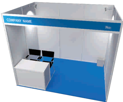
Shell Standard A (US$500/m 2 ) 9 m 2 at US$4,500*

To help boosting recovery, rental of ITE 2025 remain at US$460 per SQM for Raw Space so no change from 2019 to 2025.